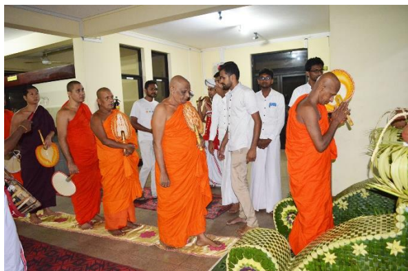
Annual Pirith Chanting Ceremony - 2020