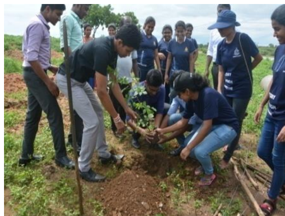
Waligaththa Medicinal Garden