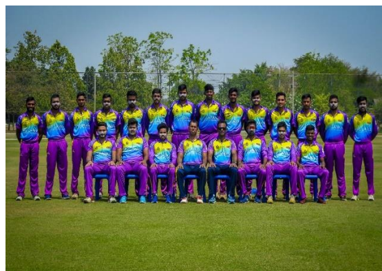
Student's participation for cricket team, Matches organized by Cricket Association of Thailand