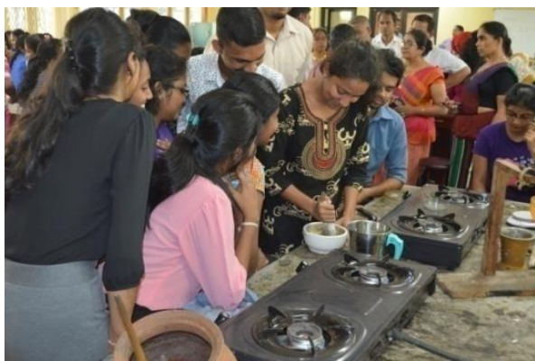
Pharmacy of the Institute