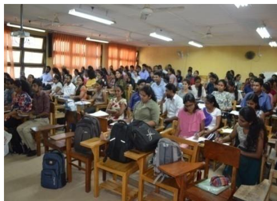
Ayurveda Lecture Halls