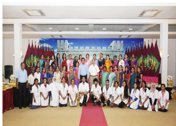
Ayurveda Medical Camp in Vijayabahu Infantry Regiment -2021