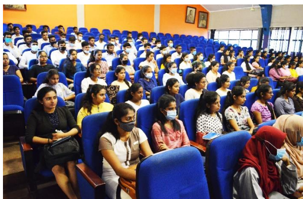
Orientation Programme - 2018/19 Batch