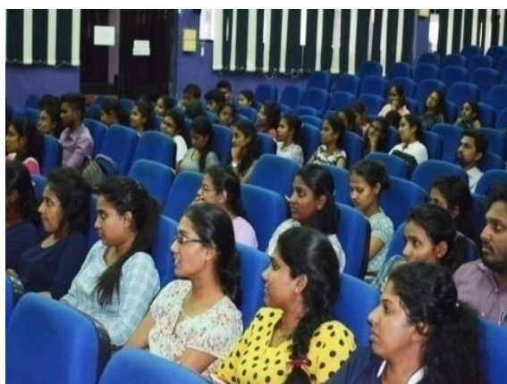
Auditorium of the Institute

Number of total students: 1442 (as at 18.06.2021)